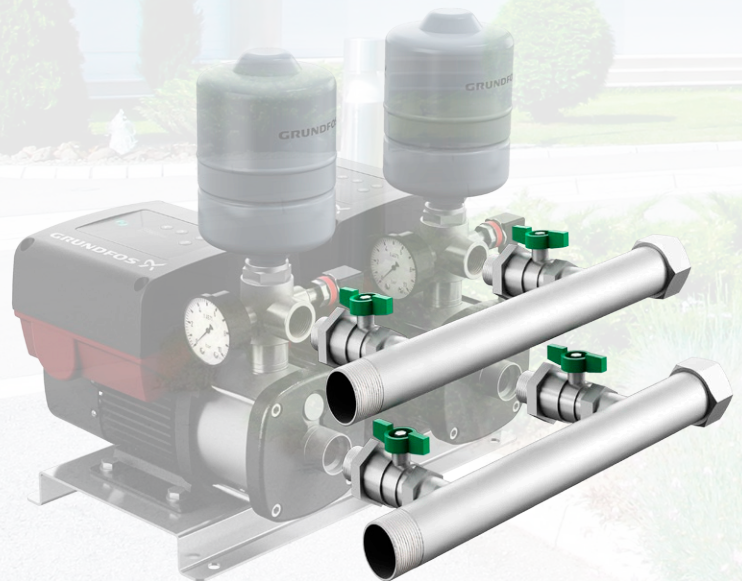
Inlet/Outlet Pipe kit for CMBE TWIN

The name Grundfos, the Grundfos logo, and be think innovate are registered trademarks owned by Grundfos Holding A/S or Grundfos A/S, Denmark. All rights reserved worldwide. 99360041/1017/12596-Brandbox