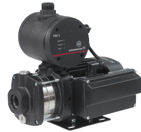
CM With Pressure Manager