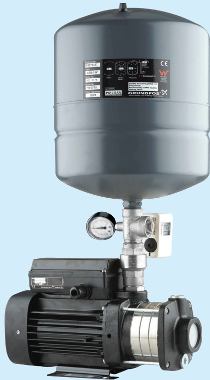
CM with Pressure Tank

The most robust pump designed ever for water pressure boosting