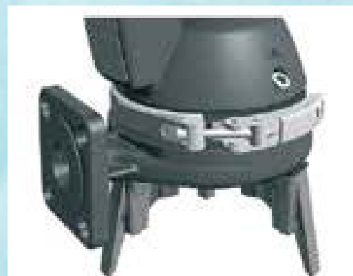
Three loose feet to be fitted to the pump housing for free-standing pumps