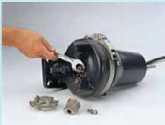
Highly effective grinder: Effective cutting by a highly reliable, patented grinder